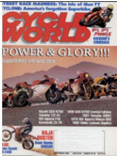
Cycle World Sept 2000

Click on these links - Home Store Front Search