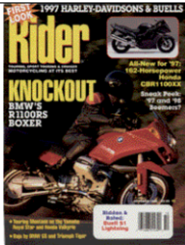
Rider Oct 1996

For more recent machines there are even more sources, such as Motorcycle Consumer News , American Rider , Sport Bike , Big Twin , Battle-2-Win etc. The reports are quite up-to-date, so even new machines are well covered. I'm told the Honda CBR600F4 report, for example, is up to 56 pages and climbing. A list of available Motorcycle Reports (including the number of articles and a page count) is accessible at www.MCReports.com .